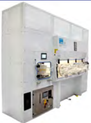
Rapid gassing isolator