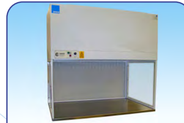
RHLF Reverse flow cabinet