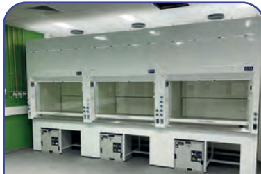
Ducted fume cupboard