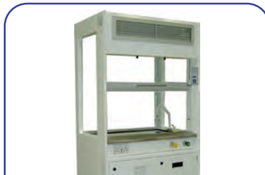
Educational Mobile recirculating fume cupboard