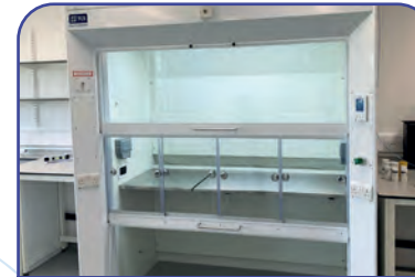
Walk in fume cupboard