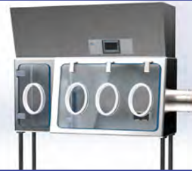
Turbulent containment isolator