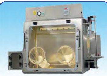
Controlled atmosphere isolator