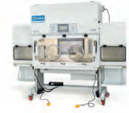
CIVAS-Assist positive pressure isolator