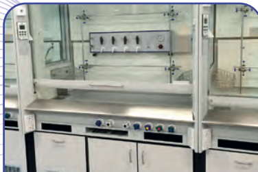
Low volume fume cupboard