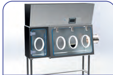
Rigid weighing and dispensing isolator