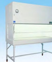
VLF R Vertical unidirectional (laminar) airflow cabinet