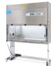
Bio 2+ Class II