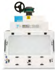
Bio 1+ Class I