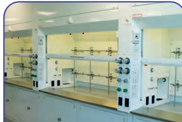
Recirculating fume cupboard