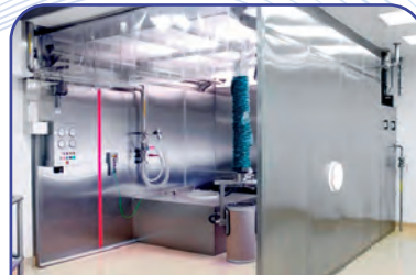
Standard downflow booth