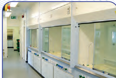
Narrow walled fume cupboard