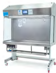
HLF Horizontal unidirectional (laminar) airflow cabinet