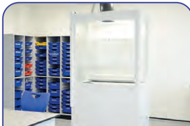
Educational Fixed ducted fume cupboard