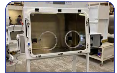
Bio 3+ Class III