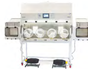
Pharm-Assist positive pressure isolator