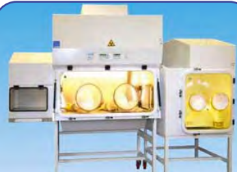
Blood labelling isolator