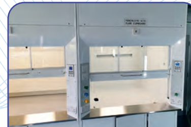
Scrubbed fume cupboard