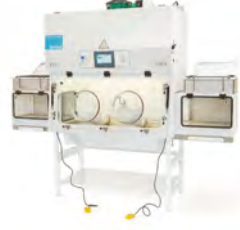
CDC F positive pressure isolator