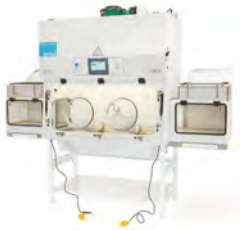
CDC F negative pressure isolator