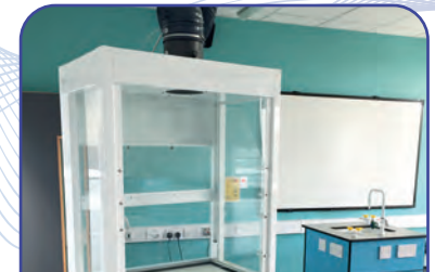
Educational Semi mobile ducted fume cupboard