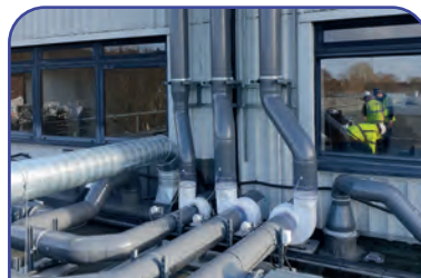
Turnkey extraction system