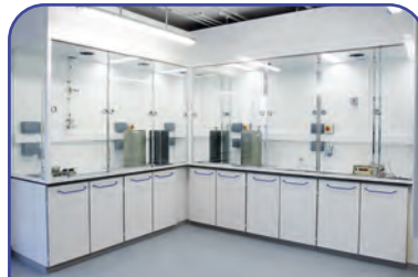
Bench type ventilated enclosure