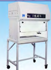
C-Flow Vertical unidirectional (laminar) airflow cabinet