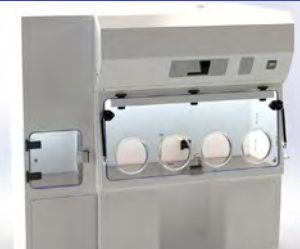
Aseptic processing isolator