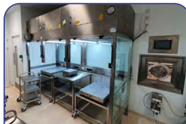
VLF E Vertical unidirectional (laminar) airflow cabinet

Find out more at www.envairtechnology.com